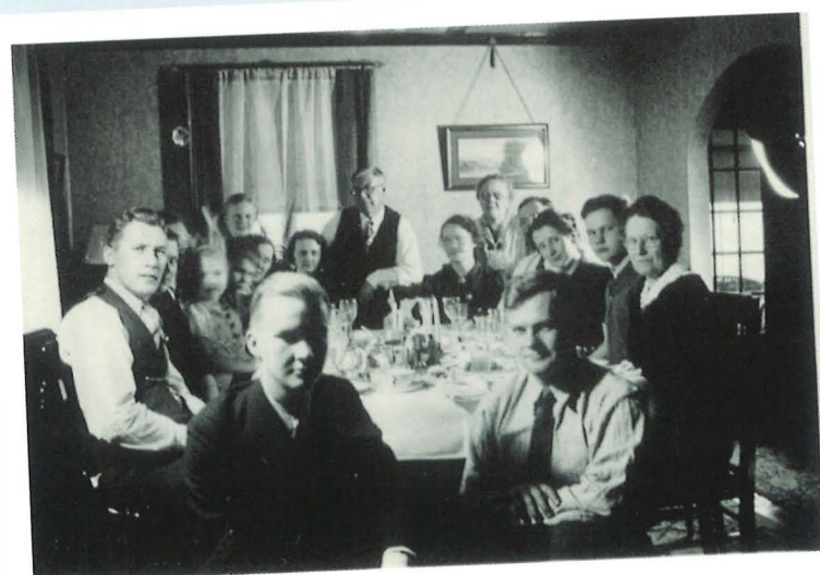
AT GRANDMOTHER'S HOUSE FOR HOLIDAY DINNER