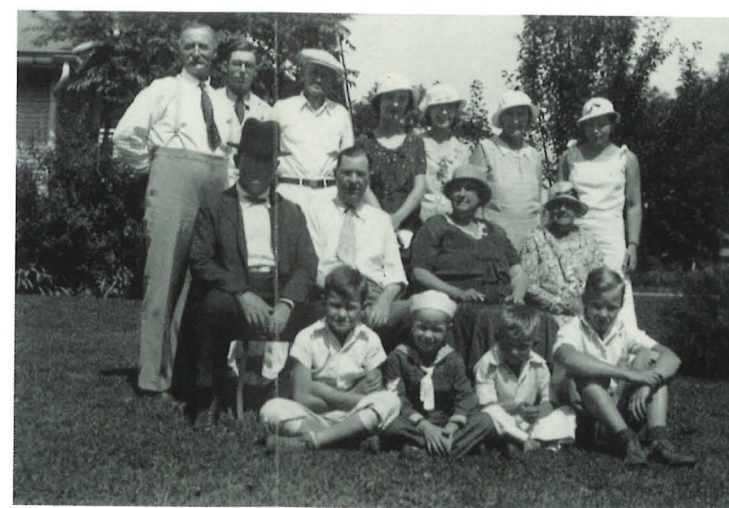
THREE GENERATIONS IN OUR BACK YARD (MY SAILOR SUIT WAS PROPHECIC)

NOW, WITH OUR ROLES CHANGED, WE CHERISH THOSE OCCASIONS THAT BRING OUR "EXTENDING" FAMILY "TO GRANDMOTHER'S HOUSE."